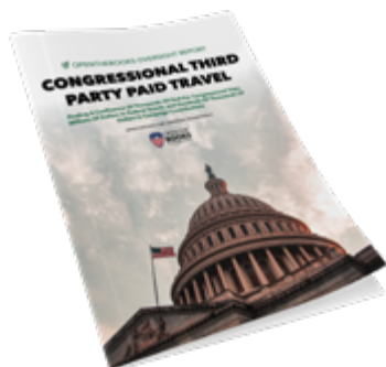
CONGRESSIONAL THIRD PARTY PAID TRAVEL