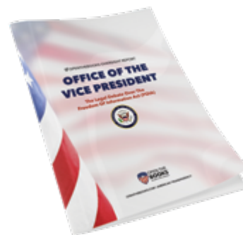
OFFICE OF THE VICE PRESIDENT

The Legal Debate Over The Freedom Of Information Act