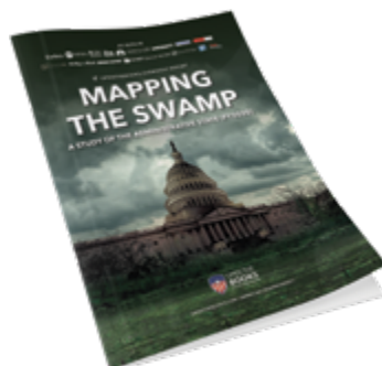
MAPPING THE SWAMP A Study of the Administrative State (FY2020)