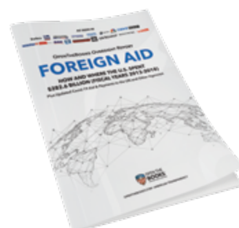
U.S. FOREIGN AID How and Where The U.S. Spent $282.6 Billion (FY2013-2018)