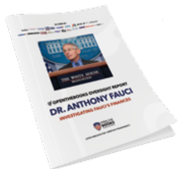
DR. ANTHONY FAUCI Investigating Fauci's Finances

The Legal Debate Over The Freedom Of Information Act