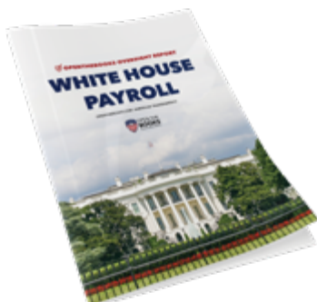
WHITE HOUSE PAYROLL