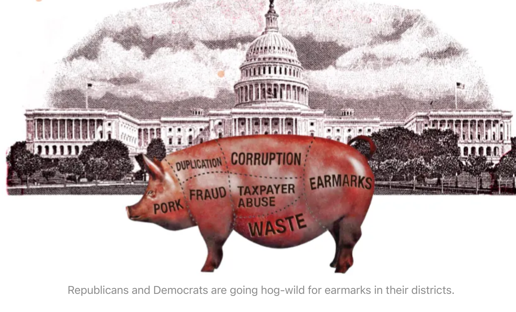
Republicans and Democrats are going hog-wild for earmarks in their districts.

PORK. PET PROJECTS. LEGAL BRIBERY. FLEEING. SLEAZE. BRIDGE TO NOWHERE. LOGROLLING. SPENDING SMORGASBORD. BACON. CURRENCY OF CORRUPTION IN CONGRESS. FAVOR FACTORY.