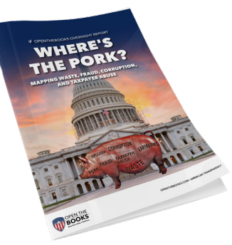
WHERE'S THE PORK? Mapping Waste, Fraud, Corruption and Taxpayer Abuse