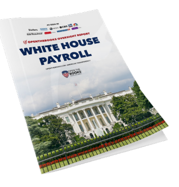
WHITE HOUSE PAYROLL