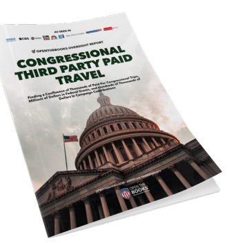
CONGRESSIONAL THIRD PARTY PAID TRAVEL