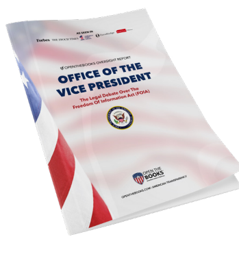
OFFICE OF THE VICE PRESIDENT The Legal Debate Over The Freedom Of Information Act